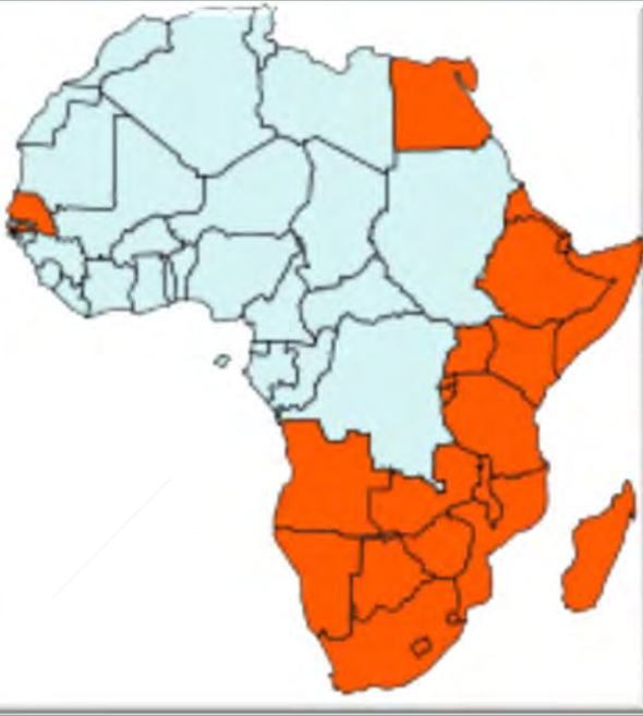
Distribution in Africa