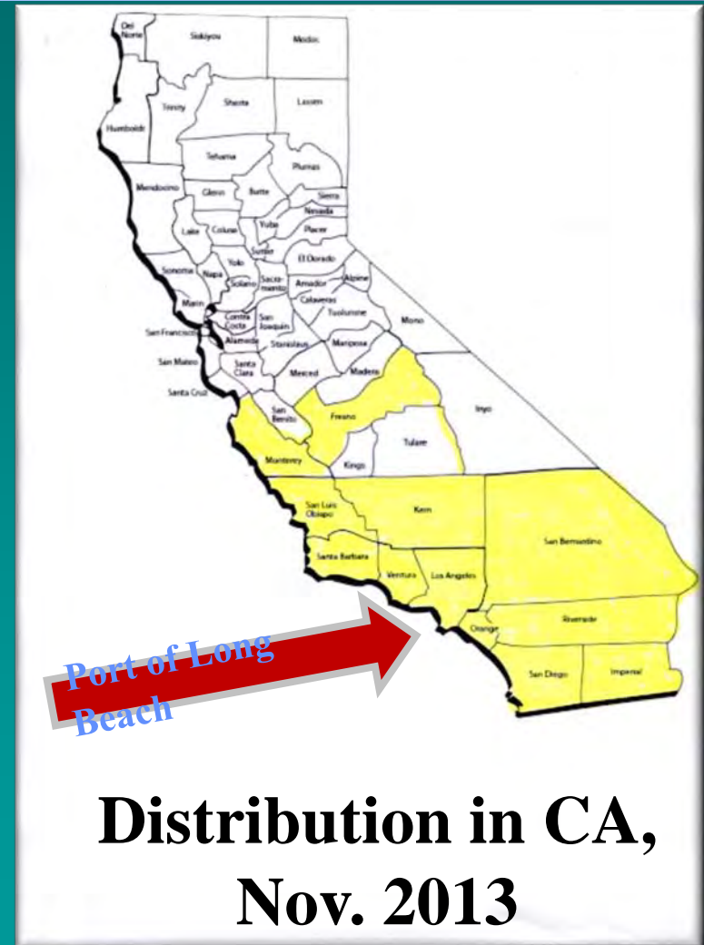
Distribution in CA, Nov. 2013