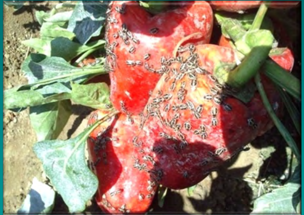
Aggregation on pepper