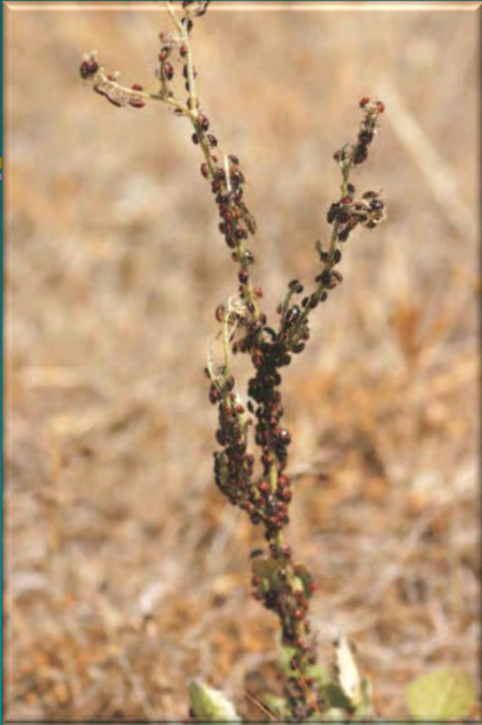
Aggregation on senescent shortpod mustard