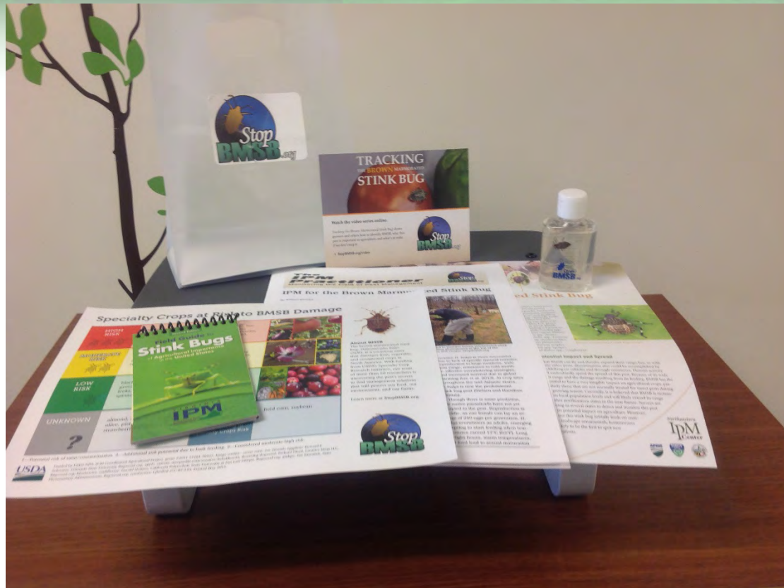
Video postcard, ID specimen, Stink Bug guide, article, factsheet, crops at risk flyer